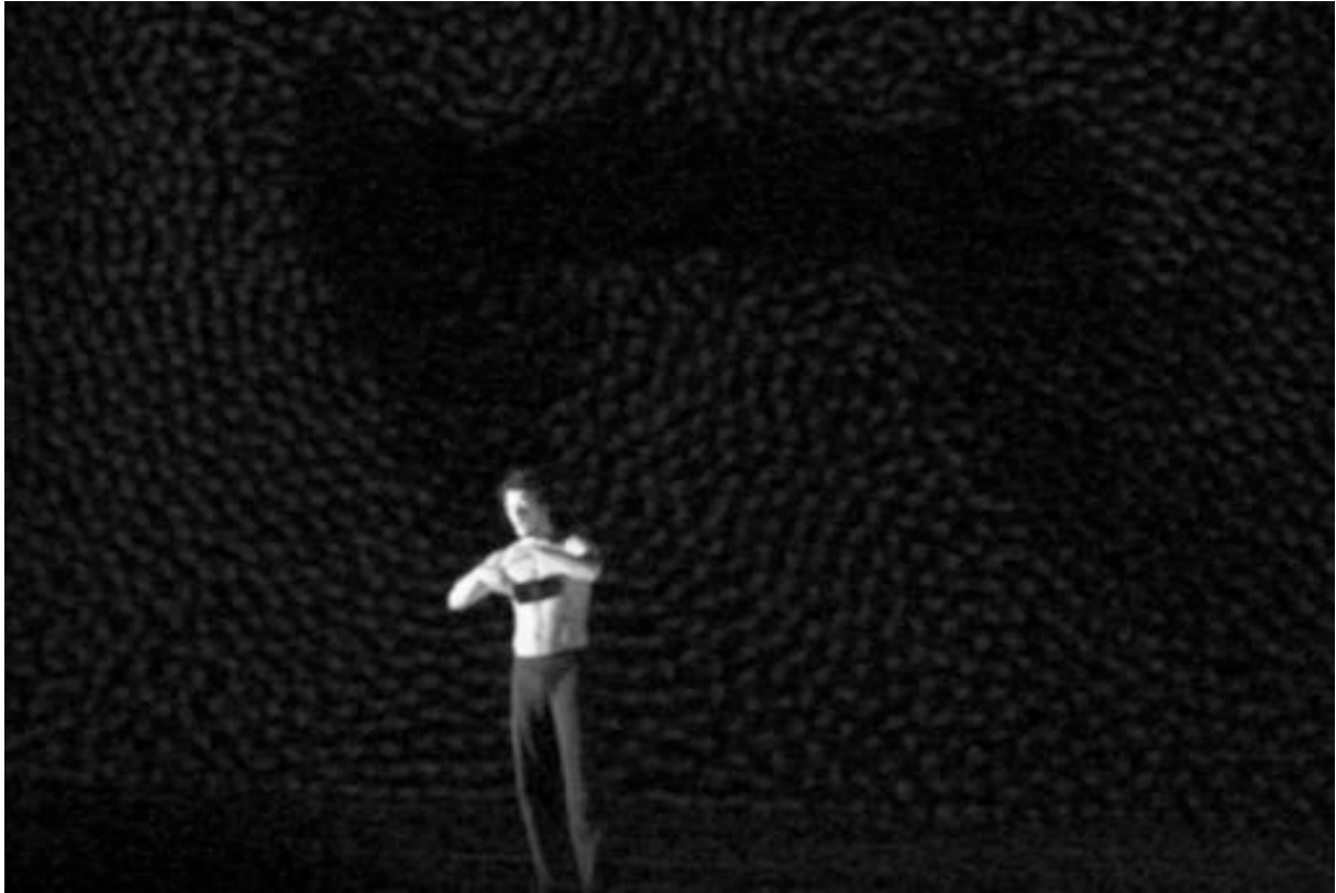
Figure 1: Swarm projection for the choreography “Vanishing Twins” by Jiri Kylián.