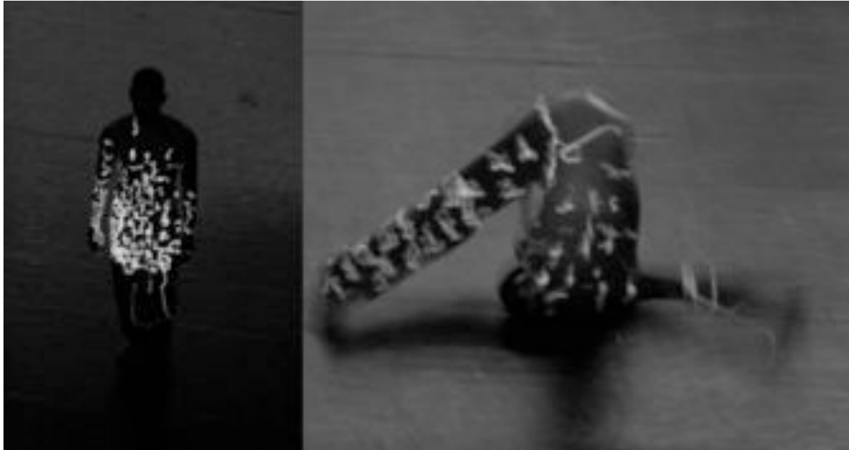
Figure 3: Swarm projection on the dancer's body in the choreography "Gods and Dogs" by Jiri Kylián.