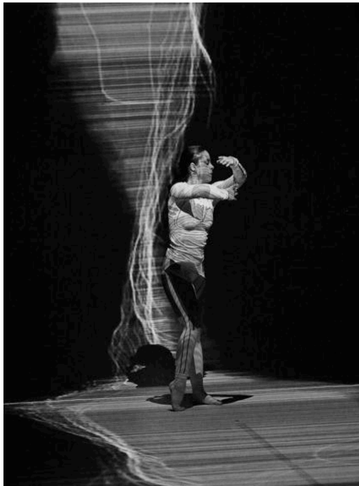
Figure 4: Swarm projection for the choreography “2047” by Pablo Venura.

At the end of the dance performance, the audience was allowed to enter the stage and interact with the swarm simulation. Through this participatory element, the swarm that had been an aspect of an entirely pre-specified choreography transformed the stage into an environment for explorative improvisation. This opportunity allowed the audience to gain an intuitive understanding for the connection between the dancer's choreographed activities and the spontaneous behavior of the swarm. It is via the interactive capabilities of the swarm that certain aspects of an otherwise highly abstract choreography became accessible to the subjective curiosity of the audience.